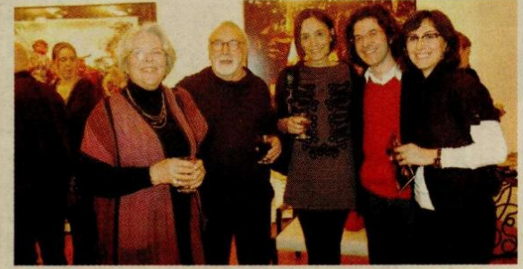
ARTISTS: Acclaimed Turkish and foreign artists attendad to the opening to view at the works of Dutch artist phenom Jasper de Beijer

The selection of works featured in the show covers nine unique series and documents the last seven years of the work of an artist who is destined to leave a powerful imprint on the international arts scene. Each series of works is a journey in time and space, where the real is dissected, weighed and measured against the ambitions or dreams of "man" via its reconstruction in a virtual environment.